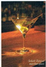
Schott Zwiesel martini glass

Bar maestro Charles Schumann has teamed up with Schott Zwiesel to create the Basic Bar Selection – a 17-piece set that includes classic and new interpretations of bar glasses and related accessories – so you can mix it up at home in style. $13-$105. Schott Zwiesel 1872, 40 Club St (6324 2931).