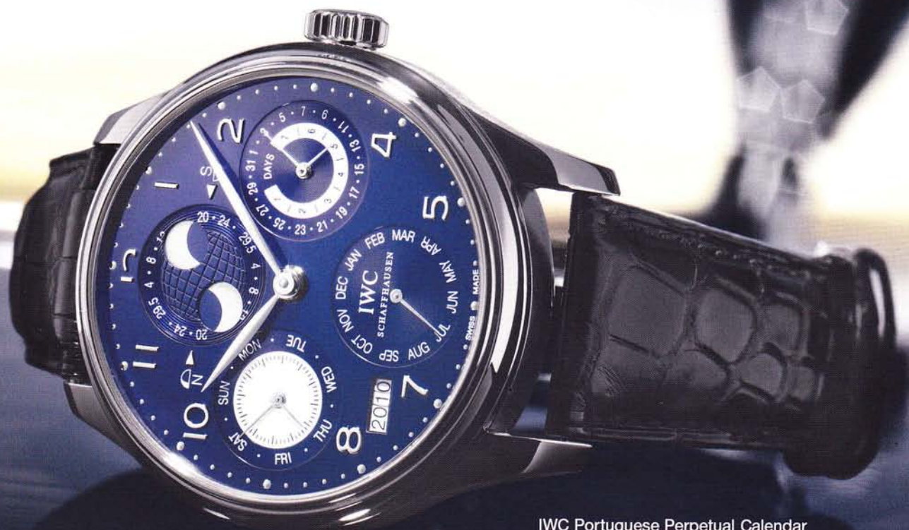
IWC Portuguese Perpetual Calendar

WHY MORE ARE GRAVITATING TOWARDS CARTIER