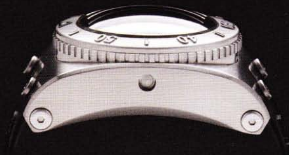
The titanium case of the Xtreme-1 Deep Diver is 20mm thick

Speaking of extreme cases, Azimuth has also launched the Landship from its SP-1 Mécanique collection. Inspired by the Mark IV World War I tank, watch out for the protruding hour display tower or turret and the crown which reminds one of the sponsons on such tanks. The Landship features a retrograde minutes display and is yet another example of Azimuth’s willingness to take on the extremes. ■